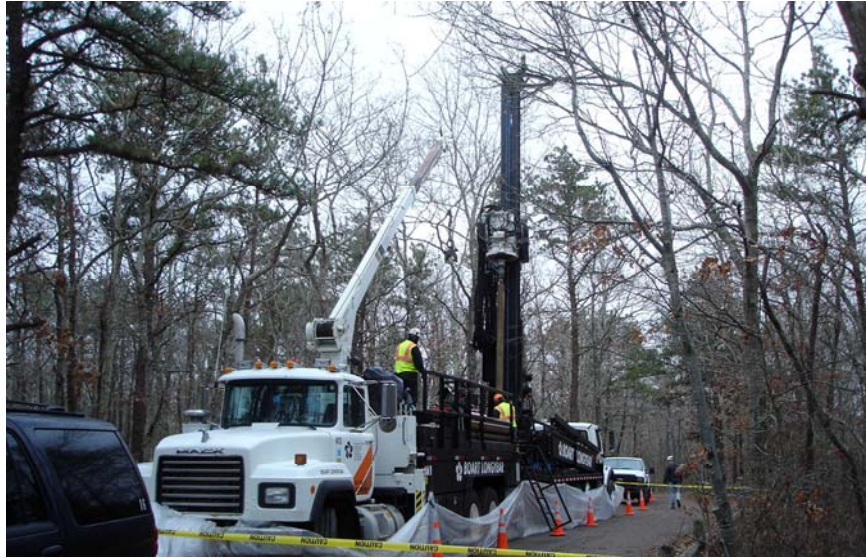
Photograph of drill rig and equipment