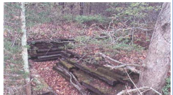
Former Grenade Court Trenchworks (an MRA) – Otis Air National Guard Base